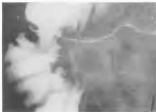
FIG. 2. Ancylostomal duodenitis .

12 it was possible to repeat the augmented histamine test after a period of over four weeks following a satisfactory antihelminthic course of treatment (Table VIII). The basal acid output seemed to drop, but this was not proved statistically significant. The study, however, has to be extended to a larger number and the acid secretion study repeated after a longer period subsequent to de-infestation, taking due care to eliminate the possibility of re-infestation.