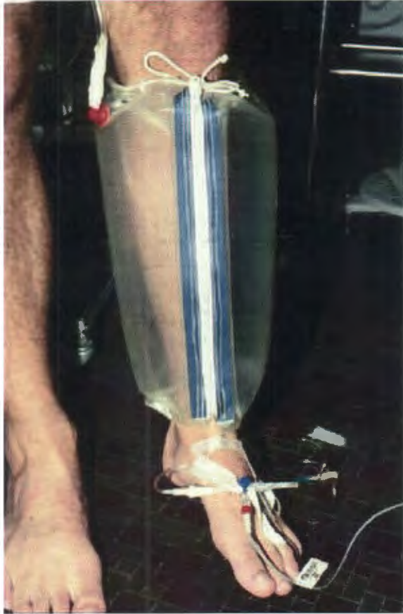
Figure 2 - Air plethysmography and ambulatory venous pressure can be performed at the same time as the tip toe movements for both tests are the same (adapted from Raju et al 4 )

The following parameters were obtained: venous volume (VV), venous filling index (VFI 90 ), ejection volume (EV), ejection fraction (EF), residual volume (RV), RVF and calf volume recovery time (RT).