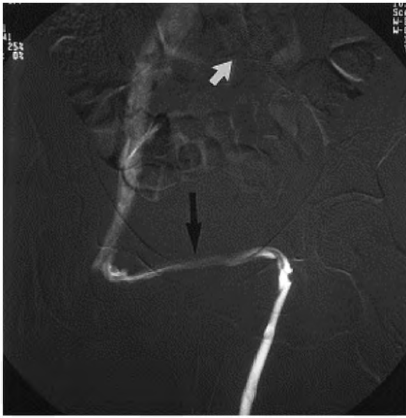
Fig 1. Venograms showing patent left to right cross-femoral saphenous vein graft 6 months after Palma procedure. From Jost CJ, Gloviczki P, Cherry KJ, McKusick MA, Harmsen WS, Jenkins GD, Bower TC. Surgical reconstructions of iliofemoral veins and the inferior vena cava for nonmalignant occlusive disease. J Vasc Surg 2001;33:320-8, with permission. 109

solution and tunneled to the contralateral groin in a suprapubic, subcutaneous position, where it is anastomosed to the common femoral vein. Excision of intraluminal post-thrombotic fibrous bands following femoral venotomy (endophlebectomy) may be needed. When suitable autologous conduit is not available, an 8 or 10-mm, externally supported expanded polytetrafluoroethylene (ePTFE) graft is the best alternative. A temporary arteriovenous fistula can be placed to improve flow and to aid patency. A large tributary of the ipsilateral great saphenous vein or the transected great saphenous vein can be anastomosed in an end-to-side fashion to the proximal superficial femoral artery. In patients with vein graft, this fistula is taken down at 3 months. In those with ePTFE grafts, the fistula should be left as long as possible in an asymptomatic patient.