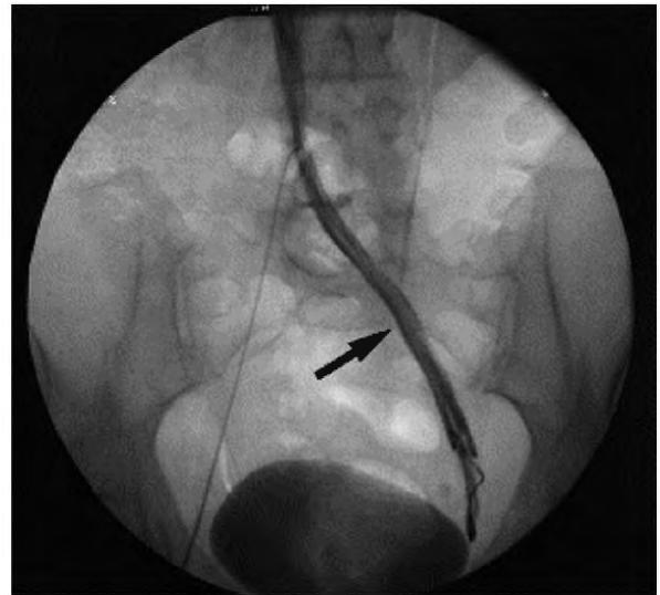
Fig 2. Patent left femorocaval PTFE bypass 11.7 years after surgery. From Jost CJ, Gloviczki P, Cherry KJ, McKusick MA, Harmsen WS, Jenkins GD, Bower TC. Surgical reconstructions of iliofemoral veins and the inferior vena cava for nonmalignant occlusive disease. J Vasc Surg 2001;33:320-8, with permission. 109

Prosthetic femorocaval or ilio caval bypass. Anatomic in-line iliac or ilio caval reconstruction can be performed for (1) unilateral disease when autologous conduit for a suprapubic graft is not available or (2) bilateral iliac,